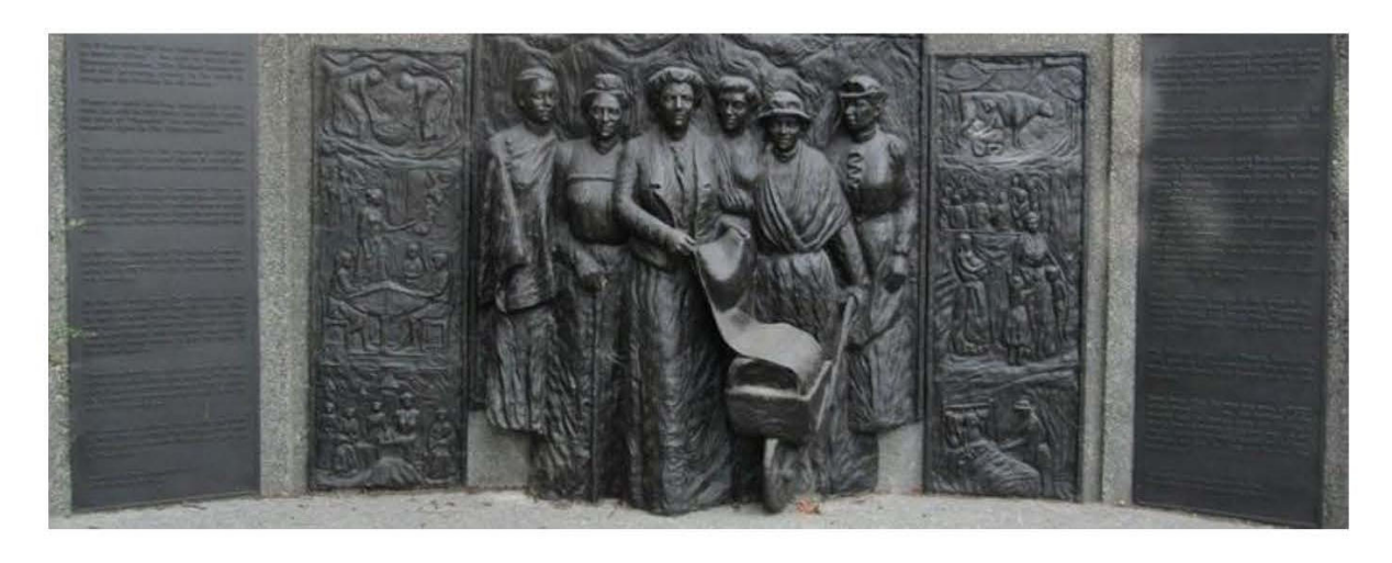
ALL WELCOME - please bring a flower – white camellia if possible.